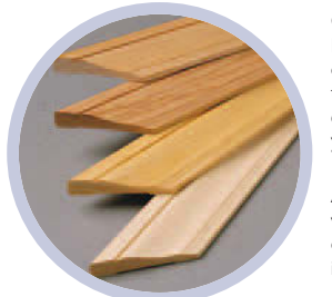
Choose 31/2" Exterior Casing or I" Brickmold to enhance the curb appeal of your home.

Accent your windows with our matching interior trim.